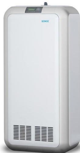
The SENE.C.Home V3 Hybrid battery